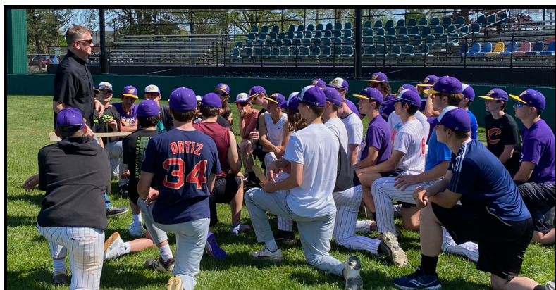
Pictured Above: Patrick Henry baseball team and Bryan baseball team. They were two of many teams that FCA worked with this past Spring.